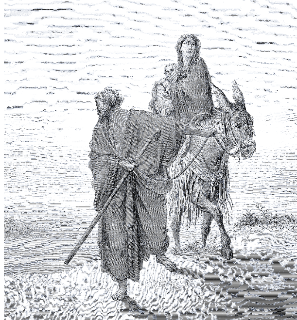
Dore, the flight to Egypt

Trusting teachings in memory of the hidden life of Saint Joseph with Jesus and Mary