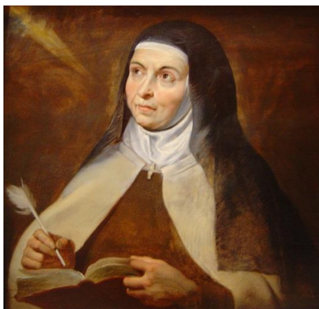
Peter Paul Rubens Teresa of Avila

"If you don't want to believe it completely, you should try it, and He will be fully convinced."